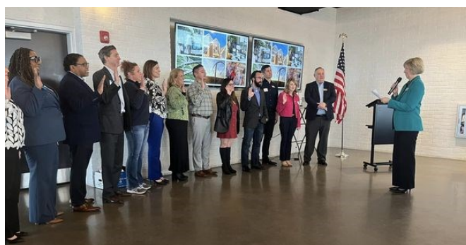
Gahanna Area Chamber of Commerce Annual Meeting