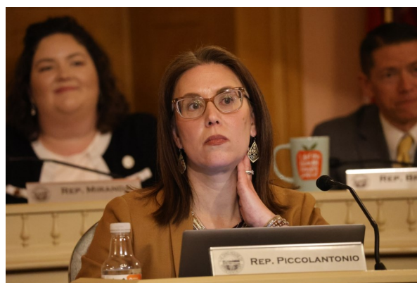
Taking the Oath of Office and listening to testimony during the Primary and Secondary Education Committee

If you would like to unsubscribe, please email rep04@ohiohouse.gov