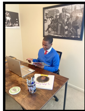
Rep. Blackshear reading to students on National Read Across America Day.

Office of State Rep. Willis Blackshear Jr.