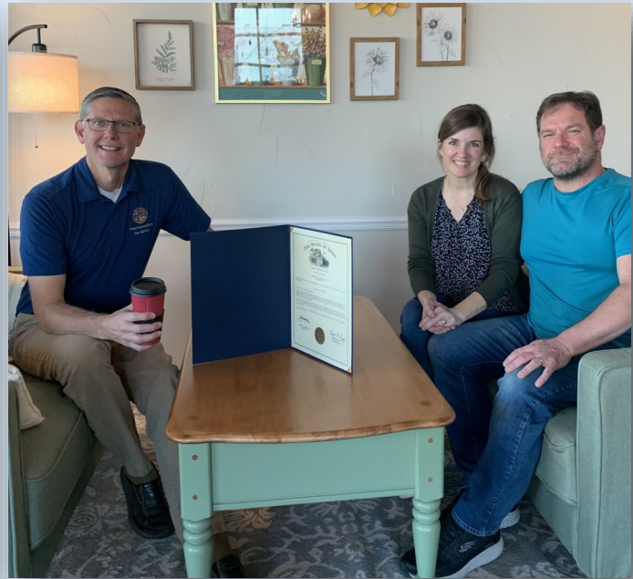
Grand Opening of the Sandstone Coffee House in Amherst