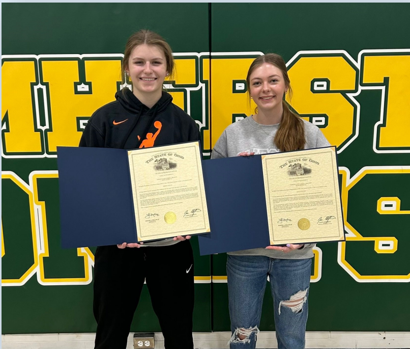
Commendations for student athletes at Steele High School

If you think you or someone you know would qualify for a commendation from my office, please reach out through email at Rep53@ohiohouse.gov or through phone at 614-466-5141 . I would love to recognize even more members of the community for all of your accomplishments!