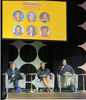
Panelist at Metro Health Women's Empowerment Expo