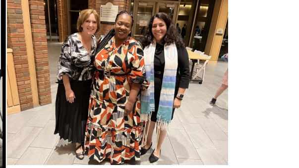
Shabbat at Temple Tifereth Israel