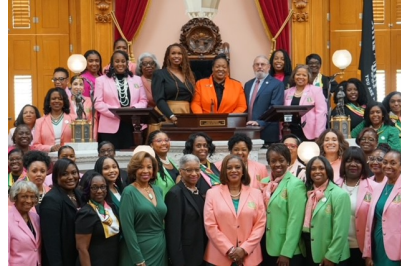
Alpha Kappa Alpha, NAACP Cleveland, NCBW100, Councilwoman Favor