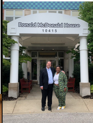
Ronald McDonald House