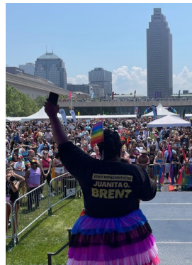
Pride in the CLE