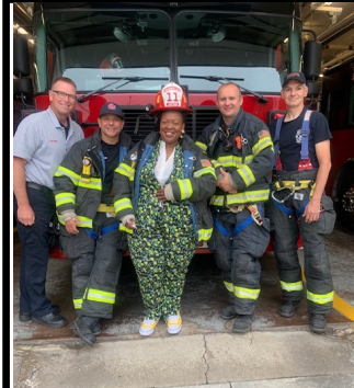
University Heights Fire Department