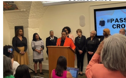
CROWN Act Press Conference