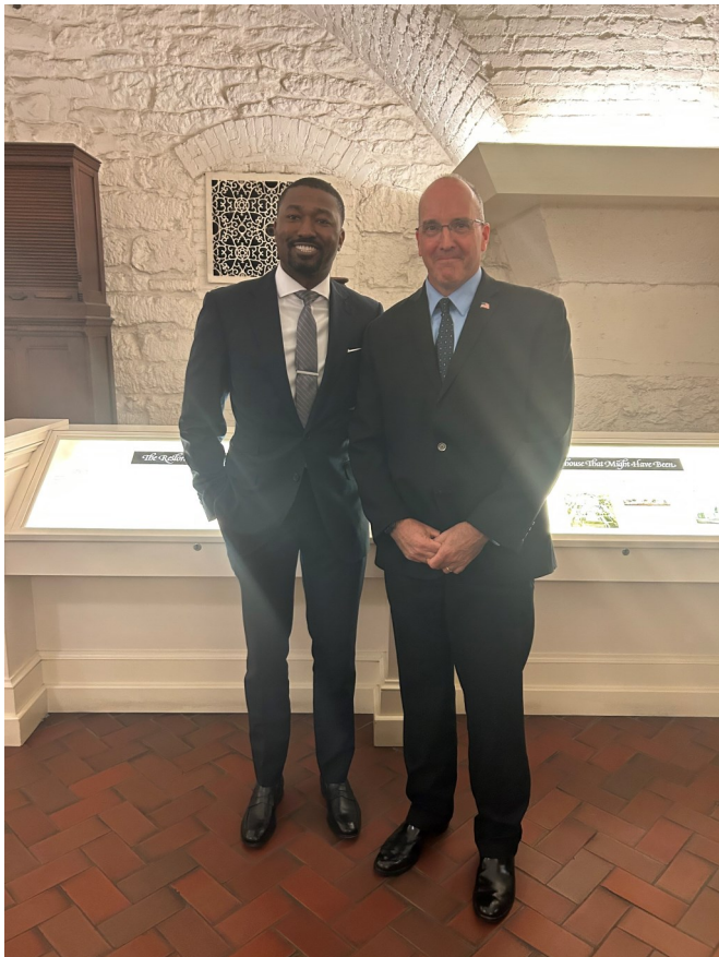
Representative Upchurch & Holmes after giving sponsor testimony on HB 253.

This bill had its 1st hearing in the House Criminal Justice Committee on October 10th. The hearing can be watched here: https://www.ohiochannel.org/collections/ohio-house-criminal-justice-committee